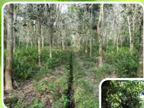
Their main income source (Rubber tree)

Although PT. Agrowiratama had been granted location permit for 9,000 hectares, more than 1,000 hectares land concession was exempted after consultations with the local community. This has earned praise from various NGOs, best summarised in one of the publicised comments as follows: "A reform of the local laws is needed so that land rights are recognized. At present, we can only rely on voluntary standards to have local communities' land rights respected. In this case Musim Mas acted responsibly. Unfortunately, it is not always the case for all companies."