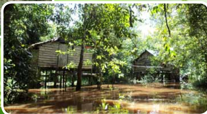
Mekar Sari Village